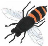
2nd prize - Violet, age 9, Longridge Towers School